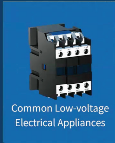
Common Low-voltage Electrical Appliances

Including low voltage knife switch, fuse, low voltage circuit breaker, contractor, relay, and master switch.